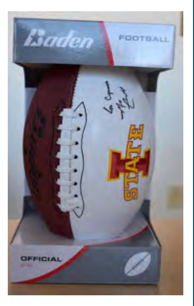
Matt Campbell Autographed Football