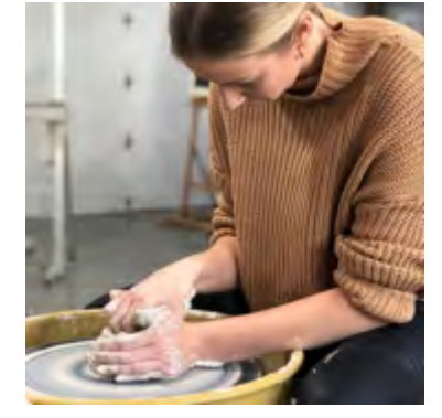
Ceramics Class for Two!