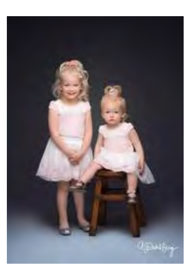
Studio Portrait Sitting