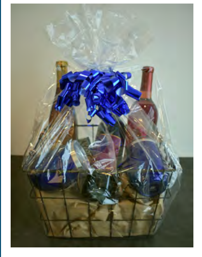
Two Saints Winery Basket