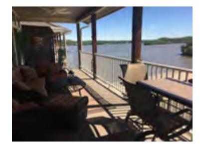
Ozark Vacation Condo