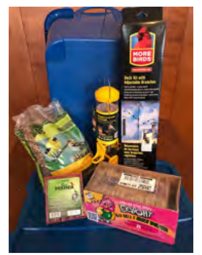
Bird Lovers Basket