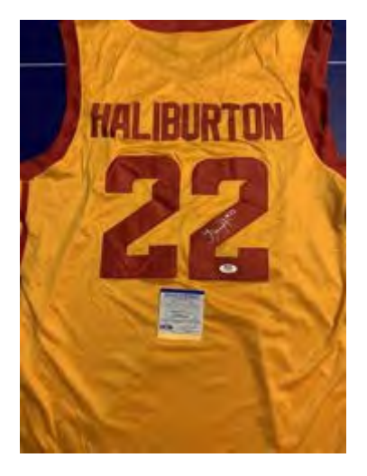
Tyrese Haliburton Autographed Jersey