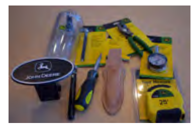
John Deere Tool Set