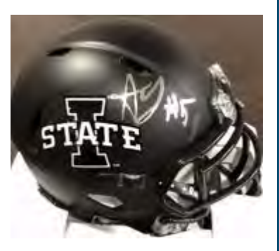
Allen Lazard Autographed Mini Helmet